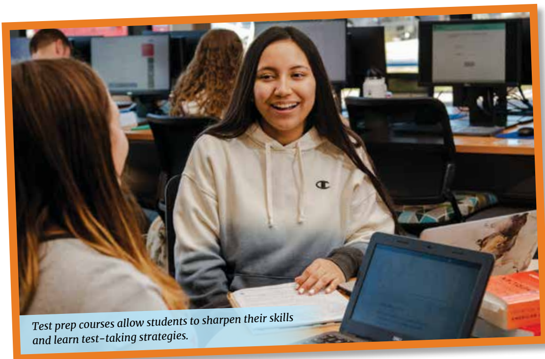
Test prep courses allow students to sharpen their skills and learn test-taking strategies.

For more information on the GED prep program, visit www.collin.edu/ce/classes/ged.html .