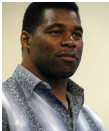
Dallas Cowboys great Herschel Walker spoke at the Central Park Campus Feb. 13 in support of Active Minds' kick-off of a week of events spreading the word about bullying.