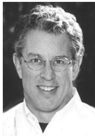
Dr. Bruce Perry

The Distinguished Speaker Series at Collin College will welcome Dr. Bruce Perry from 7-9 p.m., Thursday, March 1.