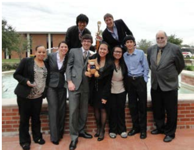
The Collin College Mock Trial Team placed seventh in the regional tournament in Houston to qualify for American Mock Trial Association Championship Series for the fourth year in a row.

For the fourth consecutive year, Collin College's Mock Trial team is making history.