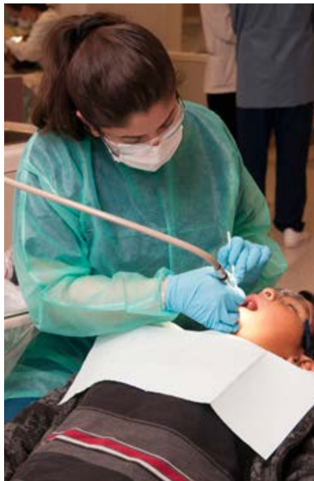
Collin College dental hygiene students assisted with cleanings and other procedures during Give Kids a Smile.