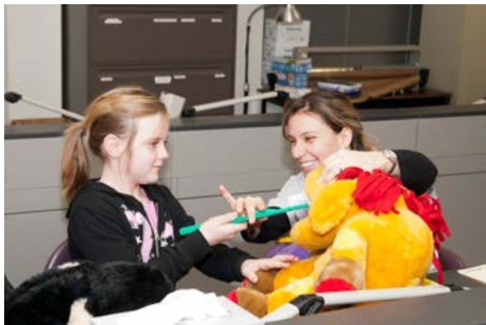
A Collin College dental hygiene student teaches a local child proper tooth care.