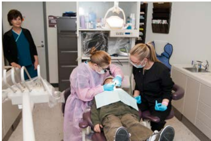
Over the years, thousands of children have benefitted from Give Kids a Smile.