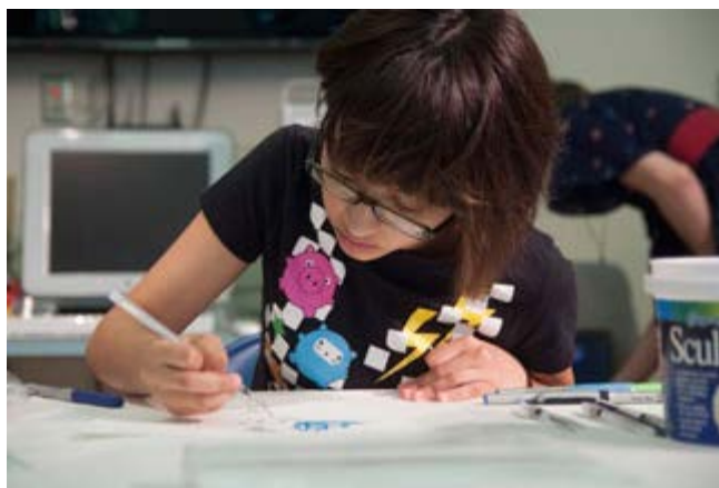
A student lays down some design during Art Day 2011 at the Spring Creek Campus.

Collin College's Fine Art department at the Spring Creek Campus invites everyone to their second annual Art Day.