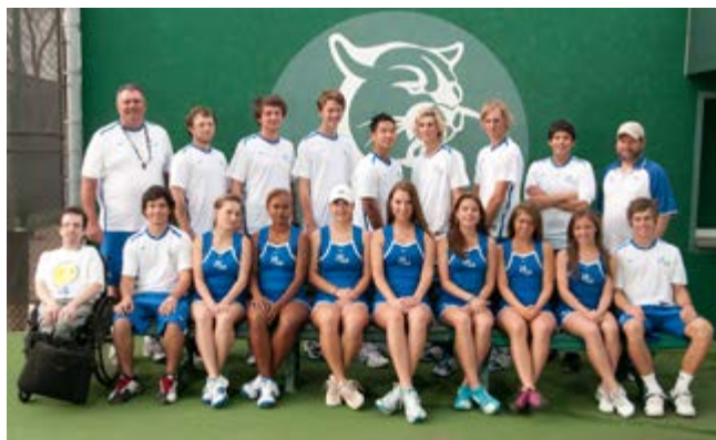
Collin College's nationally-ranked men's and women's teams