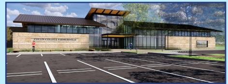
Collin College Farmersville Campus