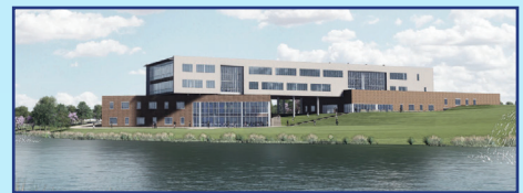
Collin College Celina Campus