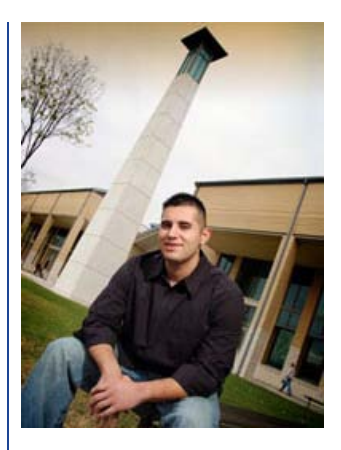
MAKE A CONNECTION WITH YOUR FUTURE!

Last modified by tbailey@collin.edu on 09/07/2010 08:39:48