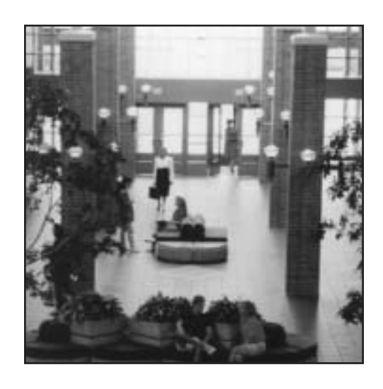
TABLE OF COTNENTS