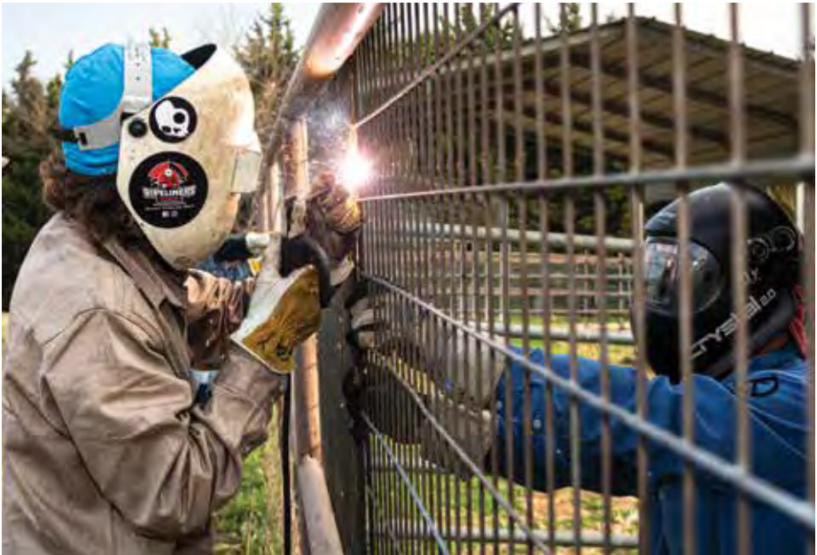
Above: Collin College students gain real-world experience as they practice welding techniques on a metal gate. Below: A Collin student uses a power grinder to smooth the edges of a metal gate under the guidance of an instructor.